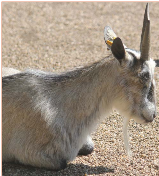
Goat ( Capra hircus )

It is important to remember that the hoof is essentially a toe tip, part of an anatomically enlarged toe. Deer, sheep, and goats walk on two toes; rhinos, tapirs and some extinct horses walk either on three toes or on one toe (living horses). The remaining toes not used for walking are either reduced, as in pigs and tapirs, or completely lost, as in rhinos and most ruminants.