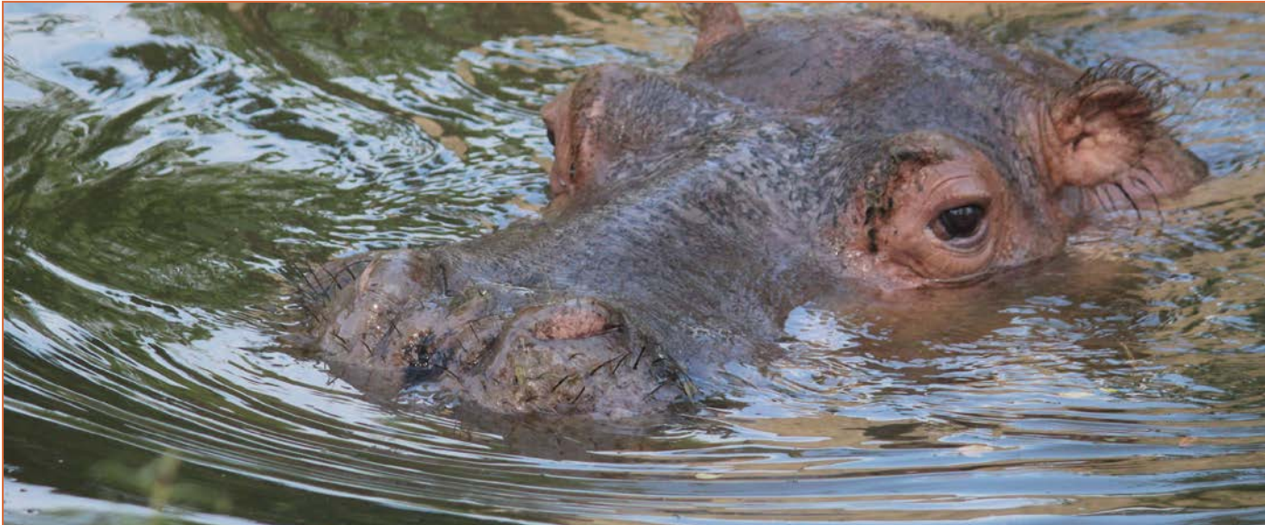
Hippopotamus ( Hippopotamus amphibius )

Ungulates are mammals which have hoofs, or structures like hoofs, on their toes. A hoof is simply an enlarged toenail. All such animals belong to the taxonomic group “Ungulata”.