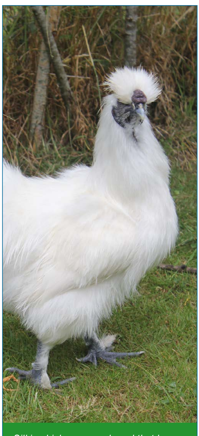
Silkie chickens are a breed that have a tendency to be docile and easy to handle. There can be exceptions; but many other breeds are more likely to have flighty, noisy or aggressive birds.

what it is. One of the challenges of comparative psychology has been to study how animals behave and think without using human terms - to try and study them impartially without making human inferences.