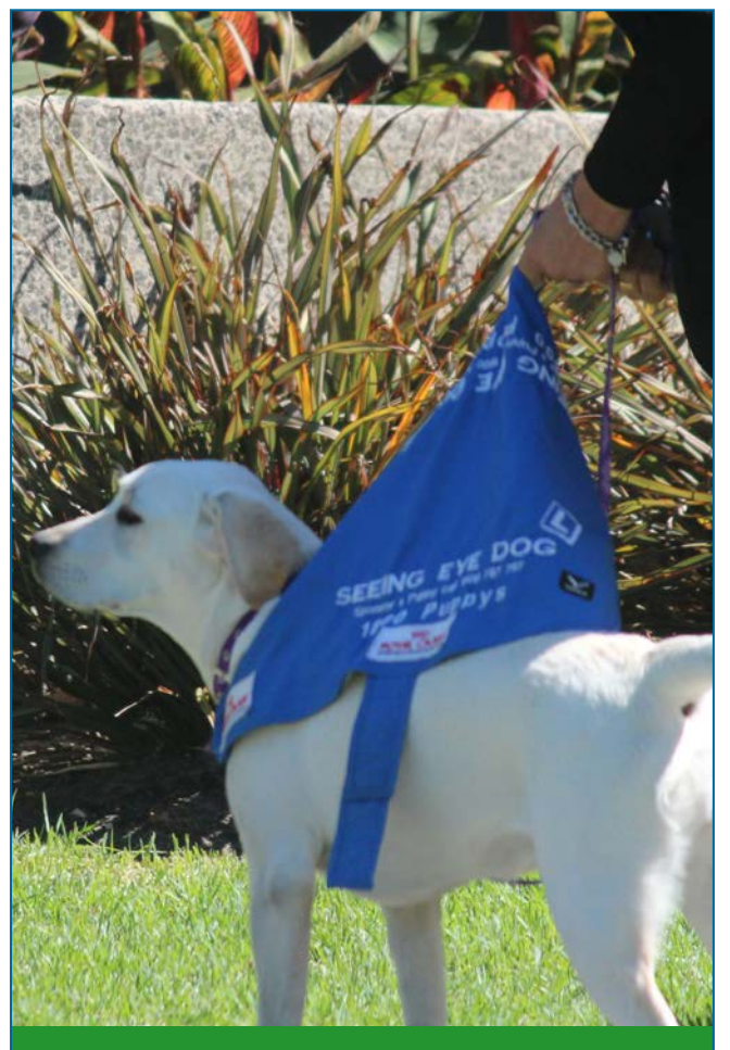
Labrador Dog is a breed that is well suited to training as a guide dog for blind people. (there's a little bit of information about this under "genetics")

Animal behaviour is an animal's observable actions. Although it can include simple reflex responses to stimuli we usually use the term behaviour to refer to more complex actions. As such, behaviour might comprise of a chain of actions where each action is dependent upon the previous one or it might be very complex pattern of actions such as those observed in dominance, aggression or courtship behaviours. Complex animal behaviour may involve cognitive processes such as learning or memory. Behaviour might also be influenced by genes and neurological, biological or chemical processes within the organism - such as by hormones.